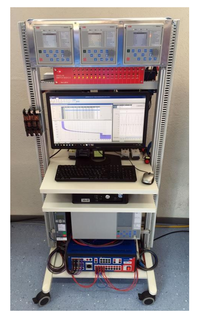
Fig. 7 – Protection and automation test bench