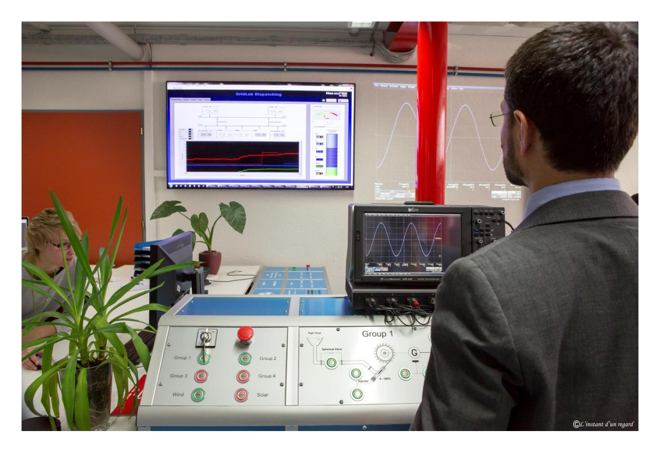
Fig. 6 – Real-time monitoring of the production mix of renewables