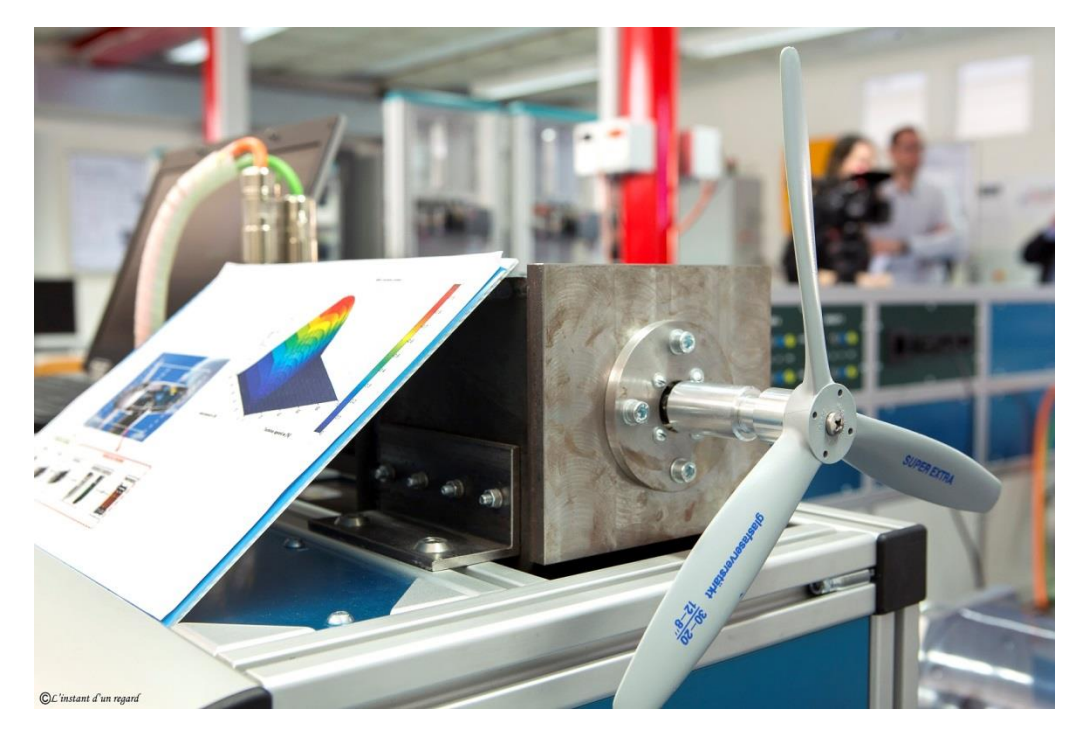
Fig. 4 – Detail of the reduced-scale model of a wind turbine