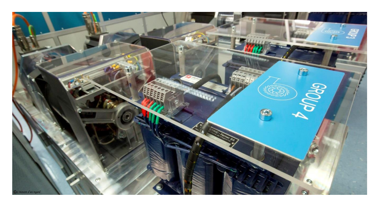
Fig. 3 – Synchronous machine and transformer of the four production groups