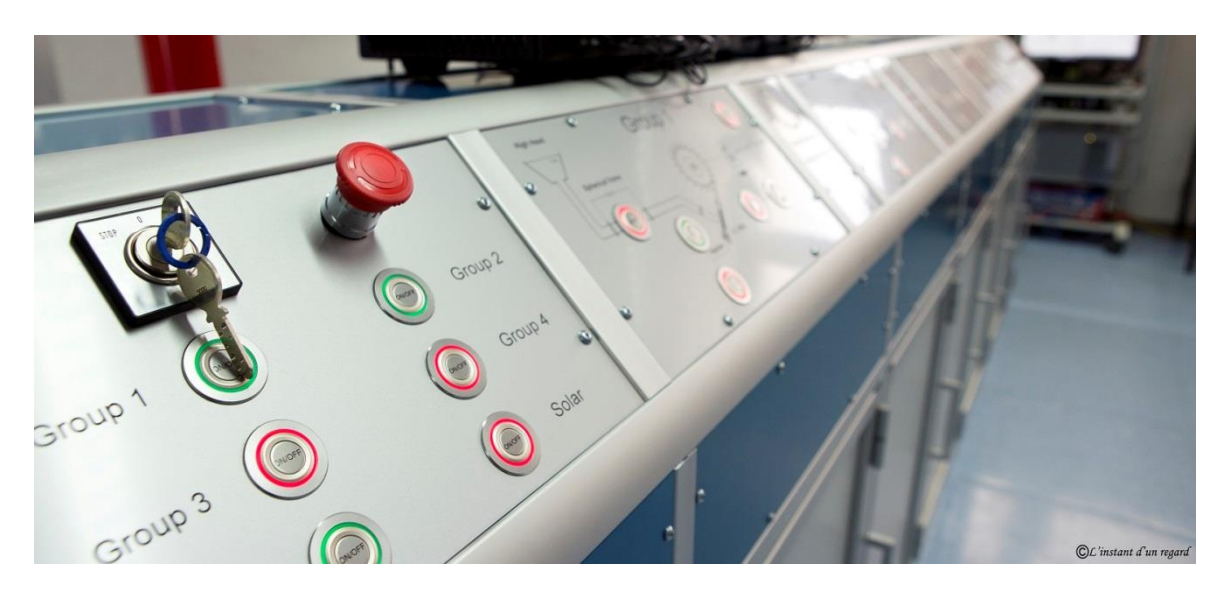
Fig. 5 – Detail of the control panel of the synchronous machines