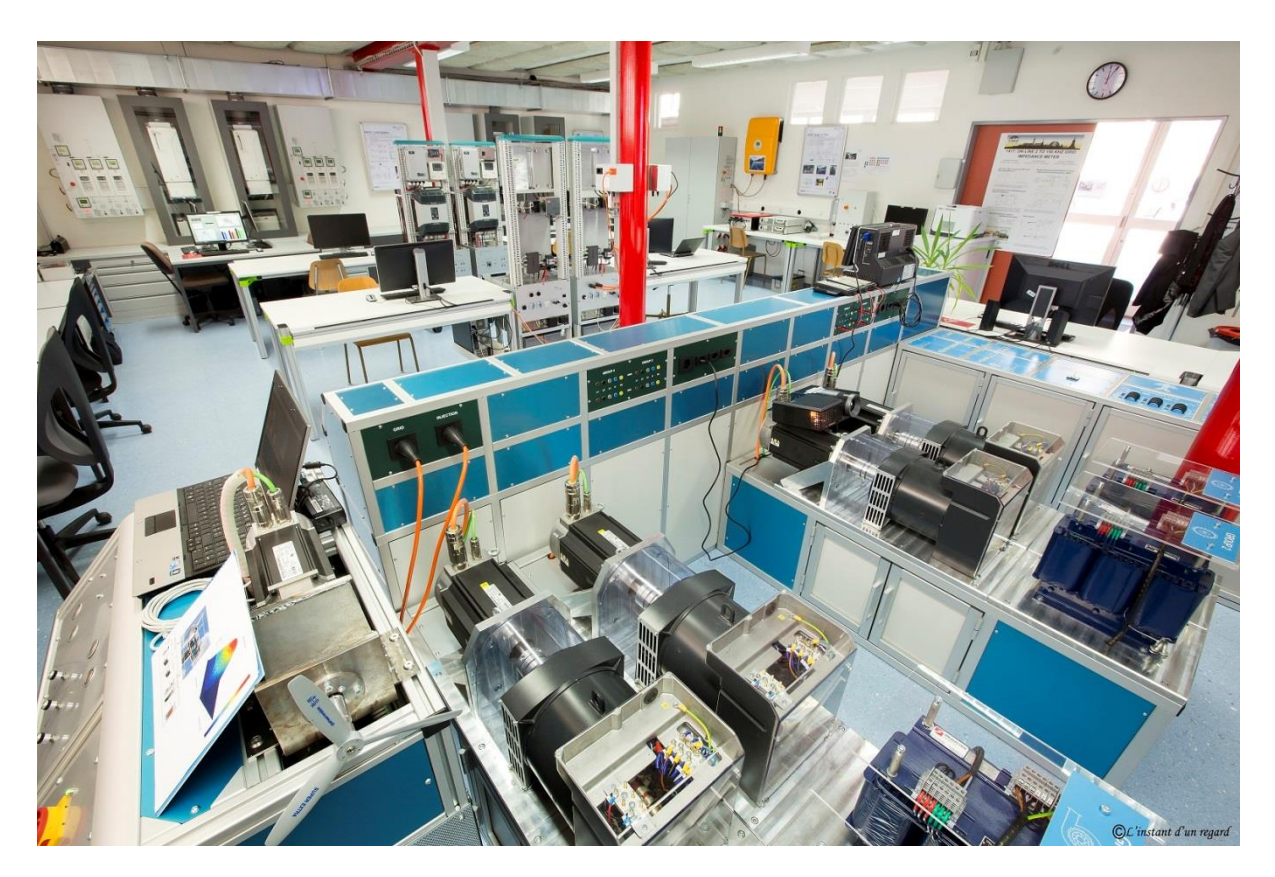
Fig. 1 – Overview of the GridLab Dispatching