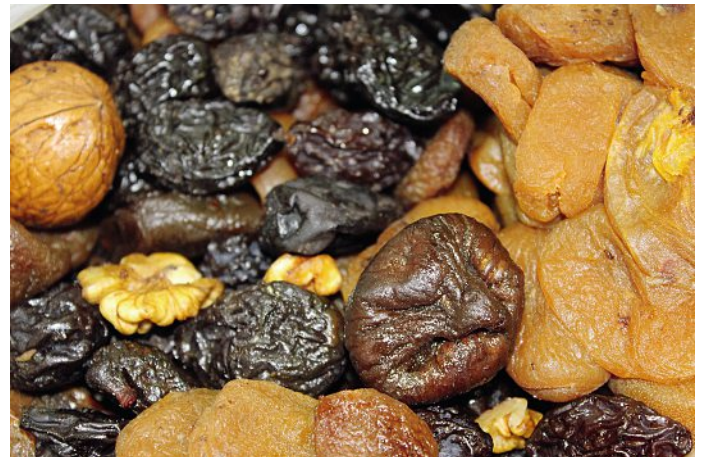
As the researchers found in their study, dried prunes, apricots, figs and walnuts – past their expiry date – serve as an excellent carbon-rich waste co-substrate for anaerobic digestion.