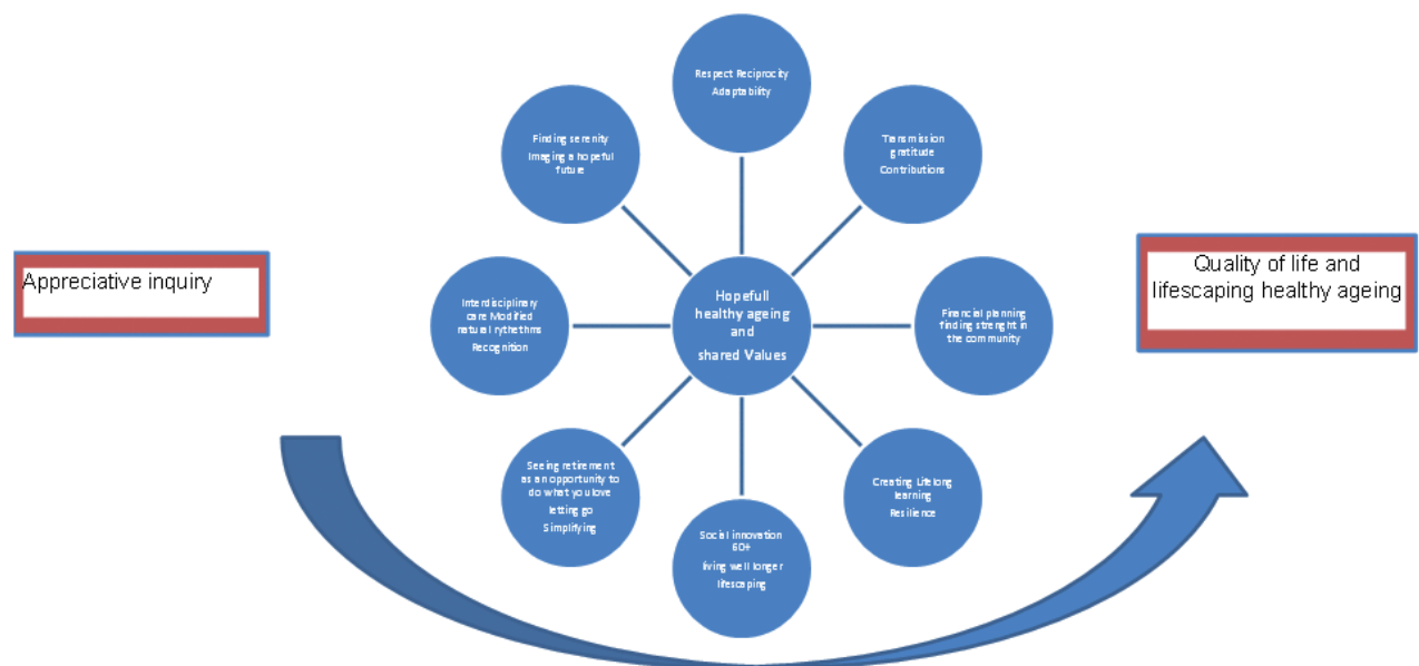
Figure 2. The hopeful health-aging model.

Most people received a gift of thirty years added on to their lifespan. This gift from our ancestors can be appreciated and used to the fullest. The new epigenetic paradigm and research area stresses how environment and perceptions can influence the expression of DNA. 35 This understanding underscores the importance of health pre-